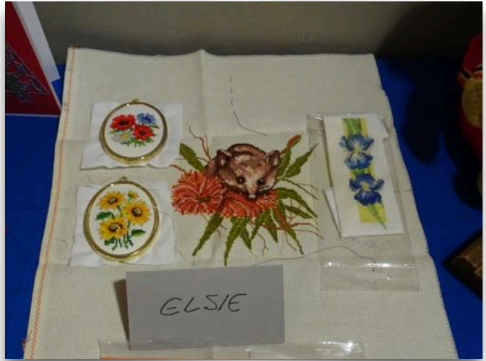
ELSIE BREMNER CROSS STITCH EMBROIDERIES