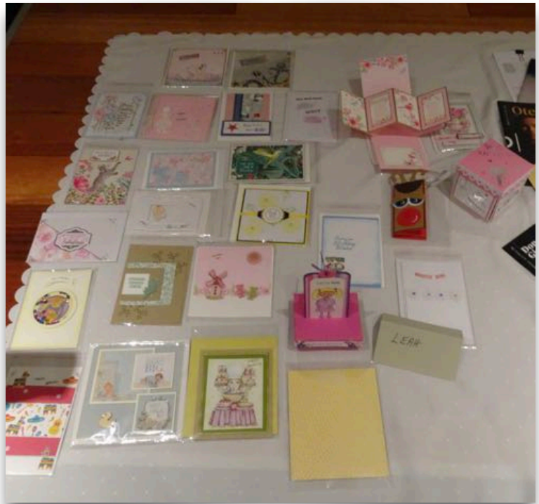
LEAH CURDS DECORATIVE CARD MAKING