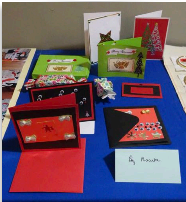
LIZ MACURA CARD MAKING