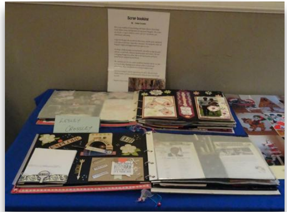
LESLEY CROSSLEY SCRAP BOOKING