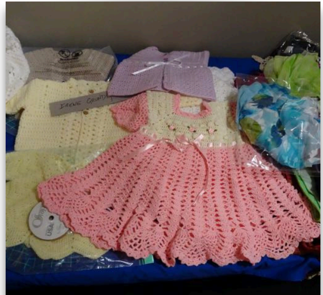
IRENE GRUNDIG KNITTED/CROCHETED BABY CLOTHES