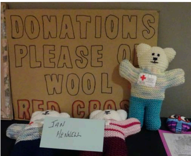
JAN HENNELL KNITTED TEDDIES FOR RED CROSS WOOL DONATIONS NEEDED PLEASE.