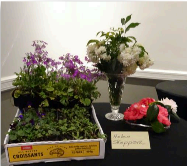
HELEN SKEPPER FLOWERS AND PLANTS FROM HER GARDEN