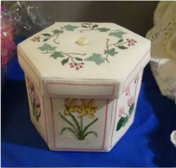
JOY WATTERS CROSS STITCH HANKY BOX & EMBROIDERED HANKIES