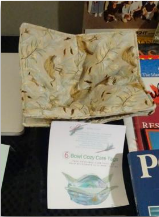
LEIGH DOWLING MICROWAVE BOWLS LEIGH DONATED THESE TO THE DRAW FOR DOOR PRIZES AT THE MEETING