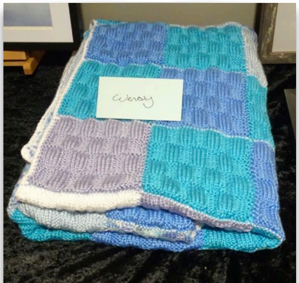
WENDY JOHNSTON KNITTED/ CROCHETED THROW