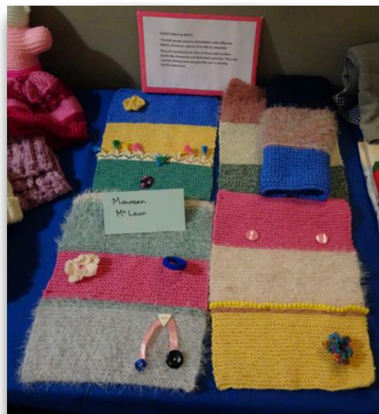
MAUREEN MCCLEAN FIDGET MATS & MITTS