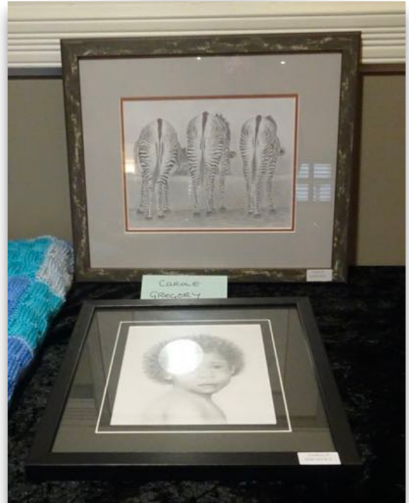
CAROLE GREGORY PENCIL DRAWINGS