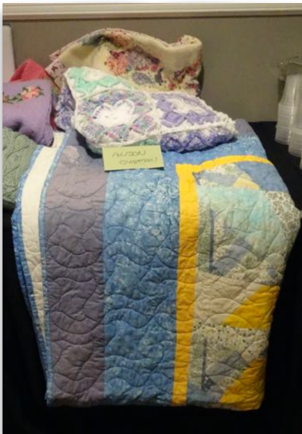
ALISON CHAPMAN PATCHWORK THROW, EMBROIDERY, KNITTING & CROCHET