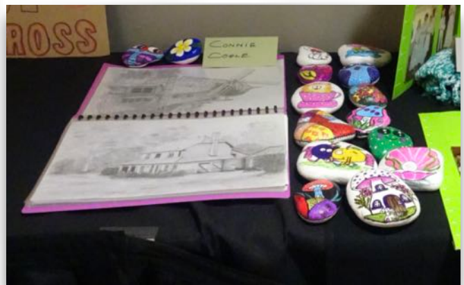
CONNIE COGLE PENCIL DRAWINGS & PAINTED STONES