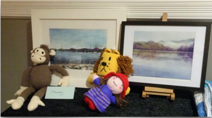
MANDY STEVENS KNITTED TOYS & WATERCOLOUR PAINTINGS