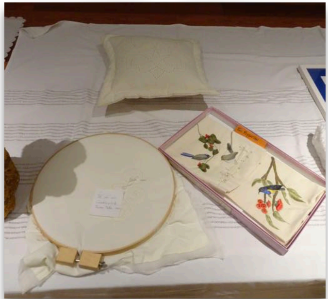
JILL MIDDLETON EMBROIDERY & STUMPWORK EMBROIDERY