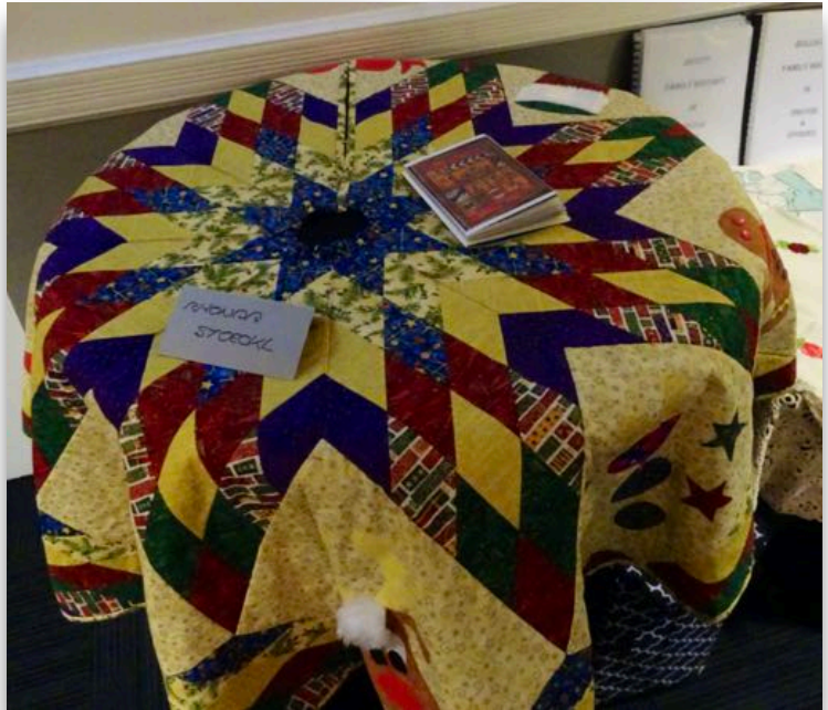
RHONDA STOECKL PATCHWORK CHRISTMAS TREE SKIRT