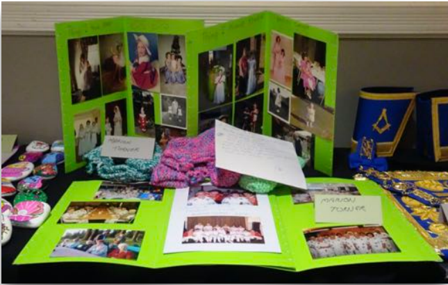
MARION TURNER PHOTOS OF CLOTHES MADE, KNITTED SOCKS & PHOTOS OF PROBUS NORFOLK ISLAND TRIP