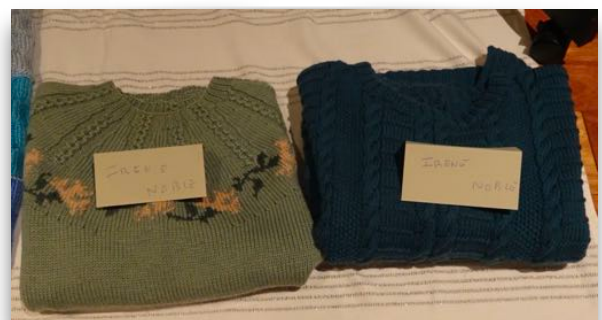
IRENE NOBLE KNITTED JUMPERS