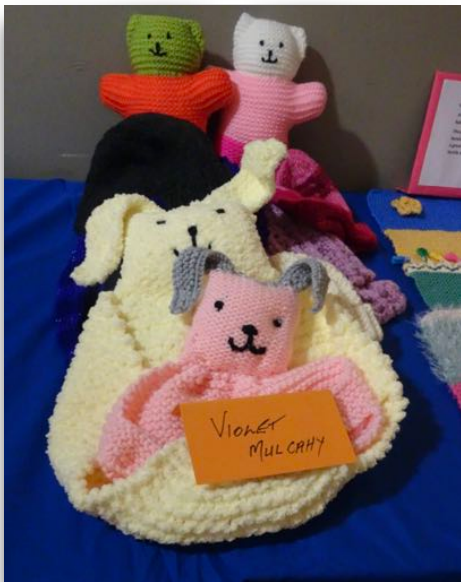
VIOLET MULCAHY KNITTED BEARS, TEDDIES & RABBITS