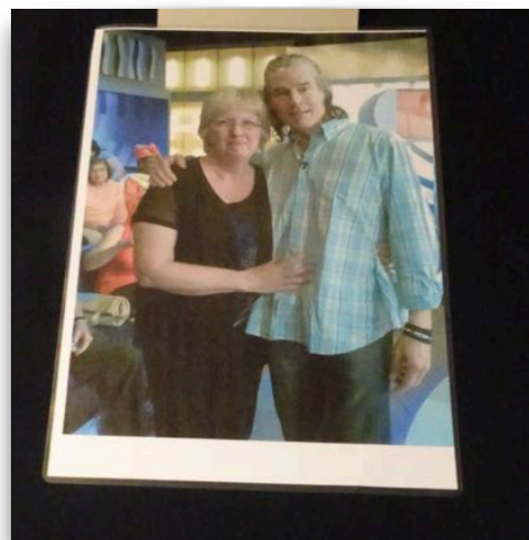
PAM BLAIN WITH RON MOSS [THE BOLD & THE BEAUTIFUL]