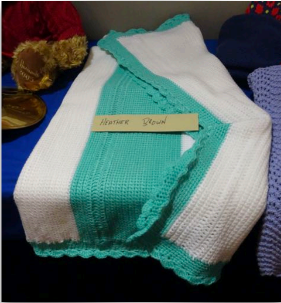
HEATHER BROWN CROCHETED THROW